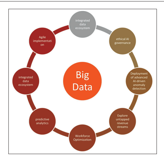
Figure 2. Implementation of analysis of harnessing the power of Big data