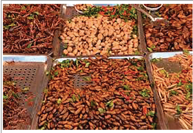
Figure 1. Various types of Edible Insects

products in a variety of ways [19] . While stem cell technology is being investigated for cultured meat, anti-nutritional factors, digestibility, allergic reactions, and biosecurity remain as constraints to the exploration of alternative protein sources such as plants, insects, and single-cell organisms [20] . Technological, sensory, and nutritional constraints continue to be problematic even with an abundance of research on substitute protein sources. The influence of processing on the structural and functional characteristics of these proteins requires additional research [21] . Uncertainties surrounding climate change create challenges for the world's population in terms of food production sustainability. Considering greenhouse gas emissions and crops suitable for human consumption are necessities for livestock, insect farming has emerged as an acceptable replacement [22] . Figure 2 below shows various types of edible insects.